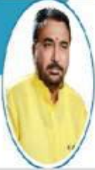
Shri Prataprao Jadhav Hon'ble Minister of State (Independent Charge) Ministry of Ayush