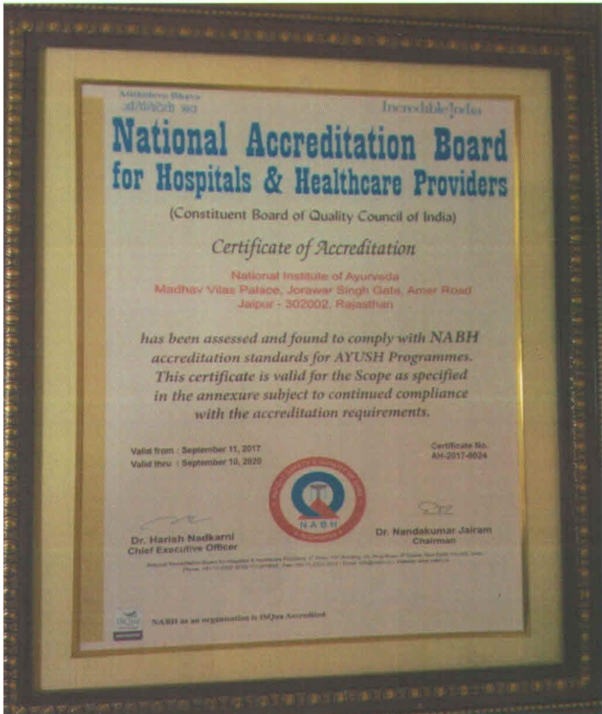
The NABH Accreditation Certificate Awarded for the NIA Hospital by National Accreditation Board for Hospitals & Healthcare Providers.