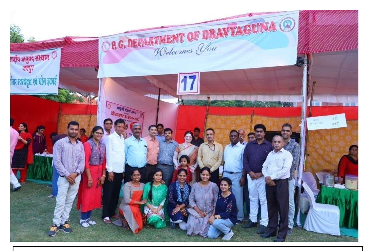
Food stall installed by the Department of Dravya Guna in Hitohar Utsave – 2019 on the occasion of 4^{th} Ayurveda Day