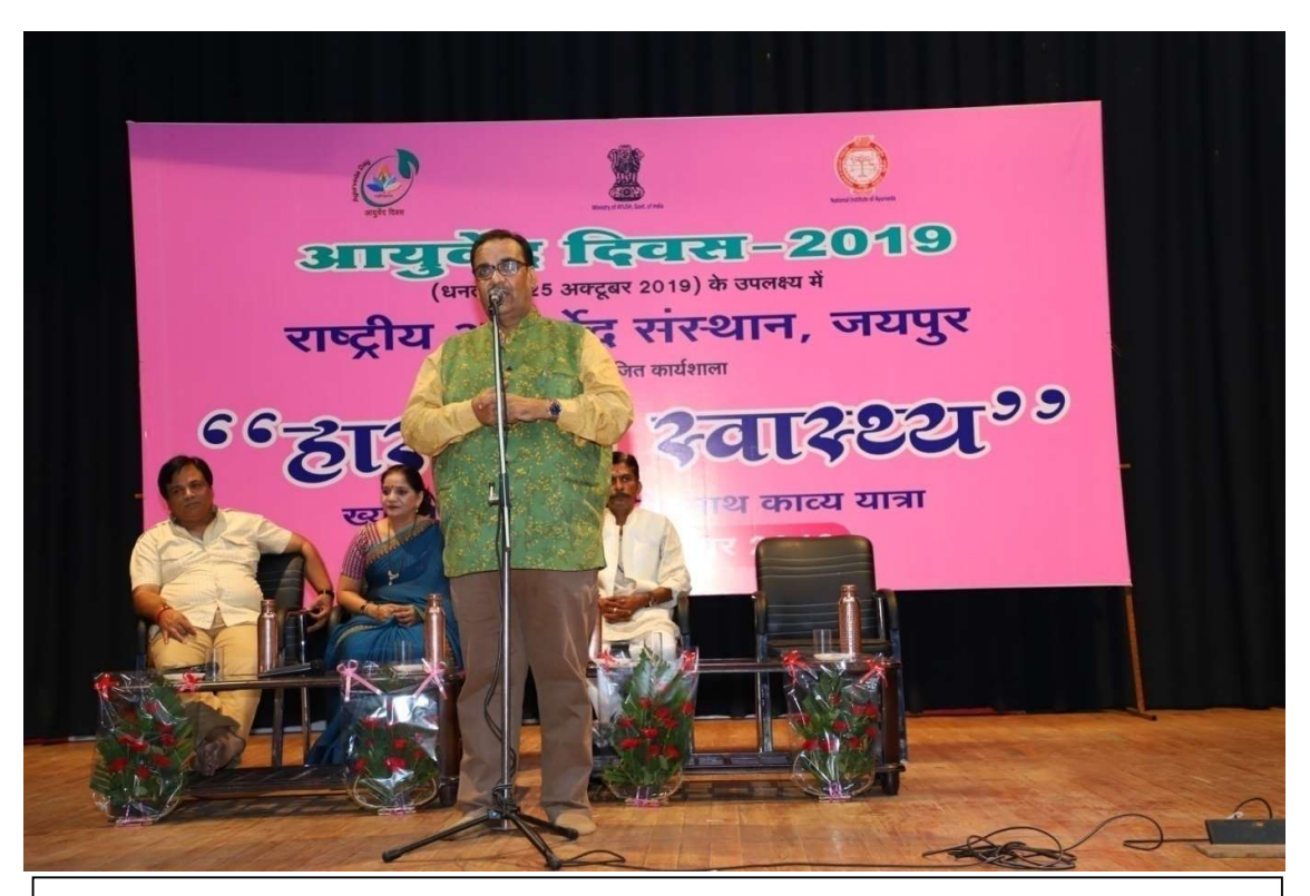
Hasya Kavi Sammelan – Hasya Se Swasthya organized by the Institute as part of celebration of Ayurveda Day-2019.