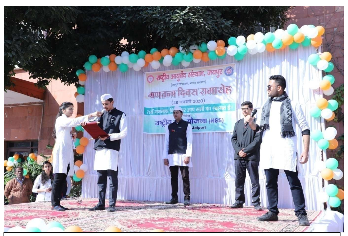
Students performing cultural program on the occasion of Republic Day Celebration