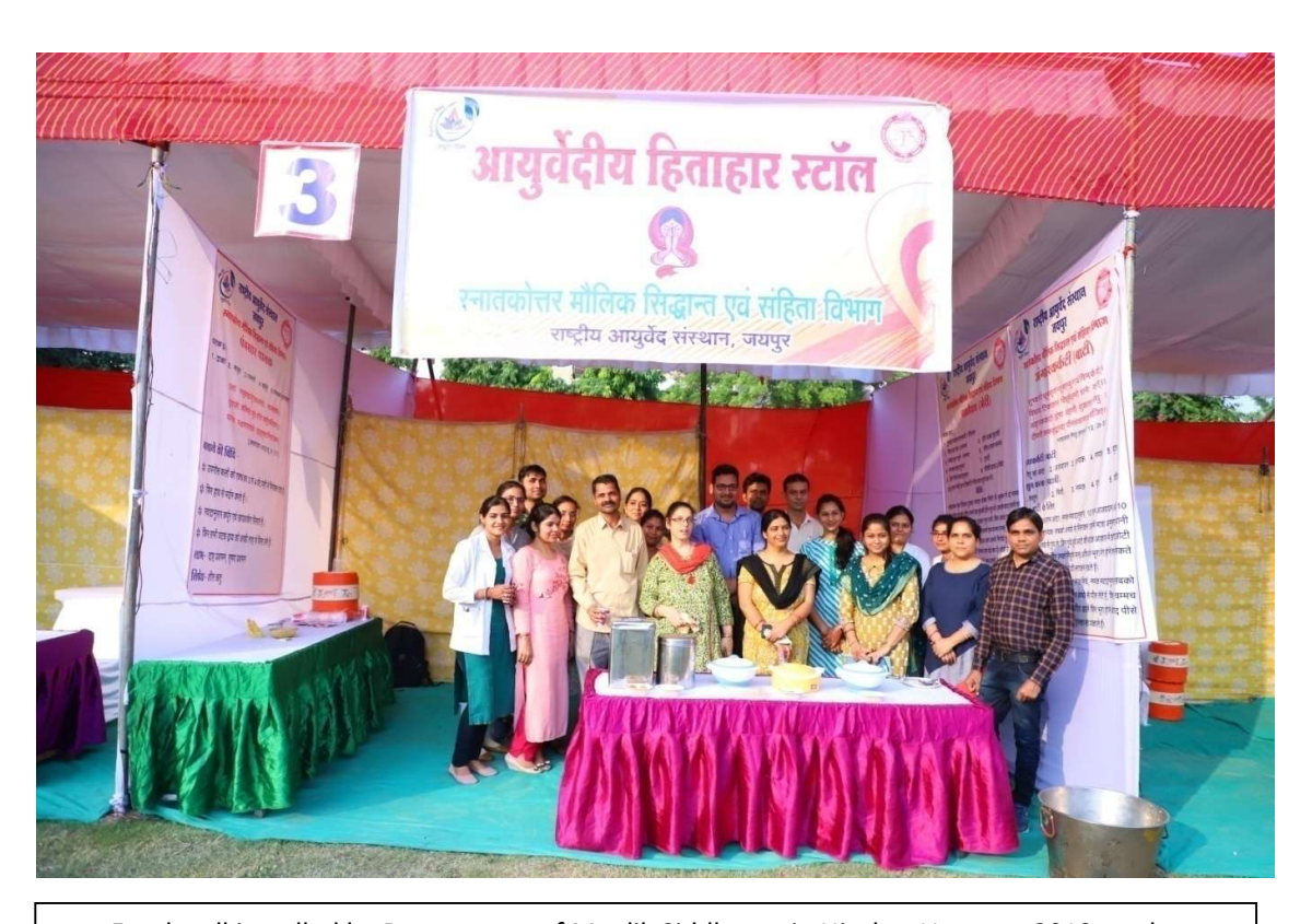
Food stall installed by Department of Maulik Siddhanta in Hitohar Utsave – 2019 on the occasion of 4^{\rm th} Ayurveda Day