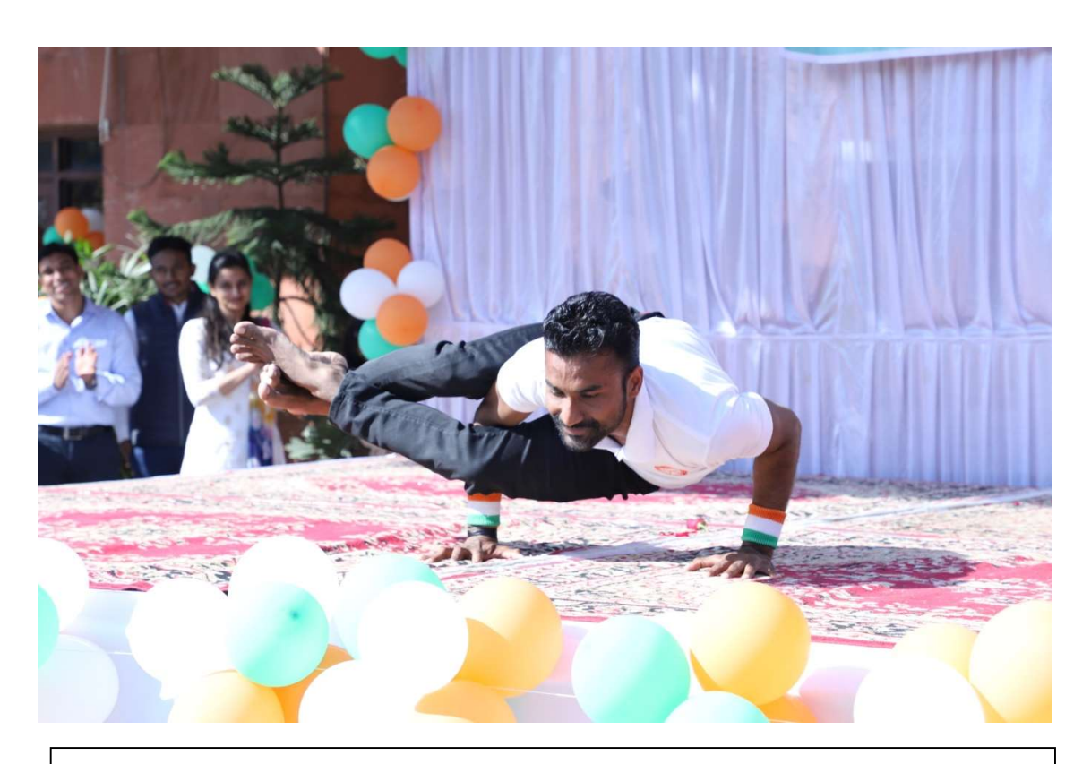
Student performing cultural program on the occasion of Republic Day Celebration