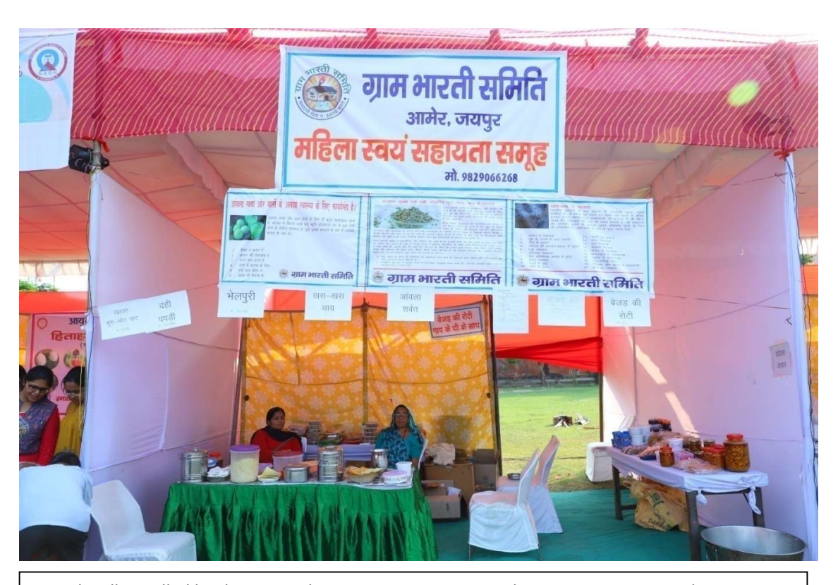
Food stall installed by the Gram Bharati Simiti, Amer in Hitohar Utsave – 2019 on the occasion of 4^{th} Ayurveda Day