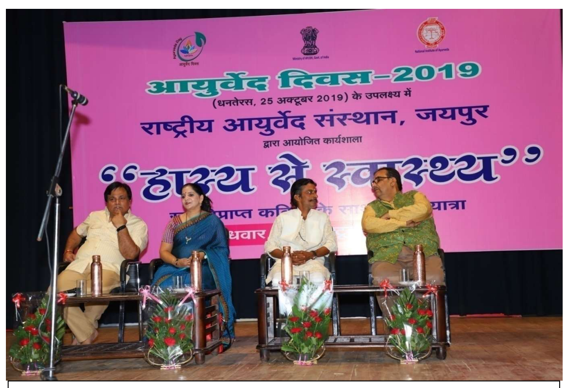
Hasya Kavi Sammelan – Hasya Se Swasthya organized by the Institute as part of celebration of Ayurveda Day-2019.