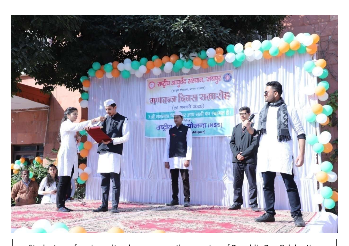
Students performing cultural program on the occasion of Republic Day Celebration