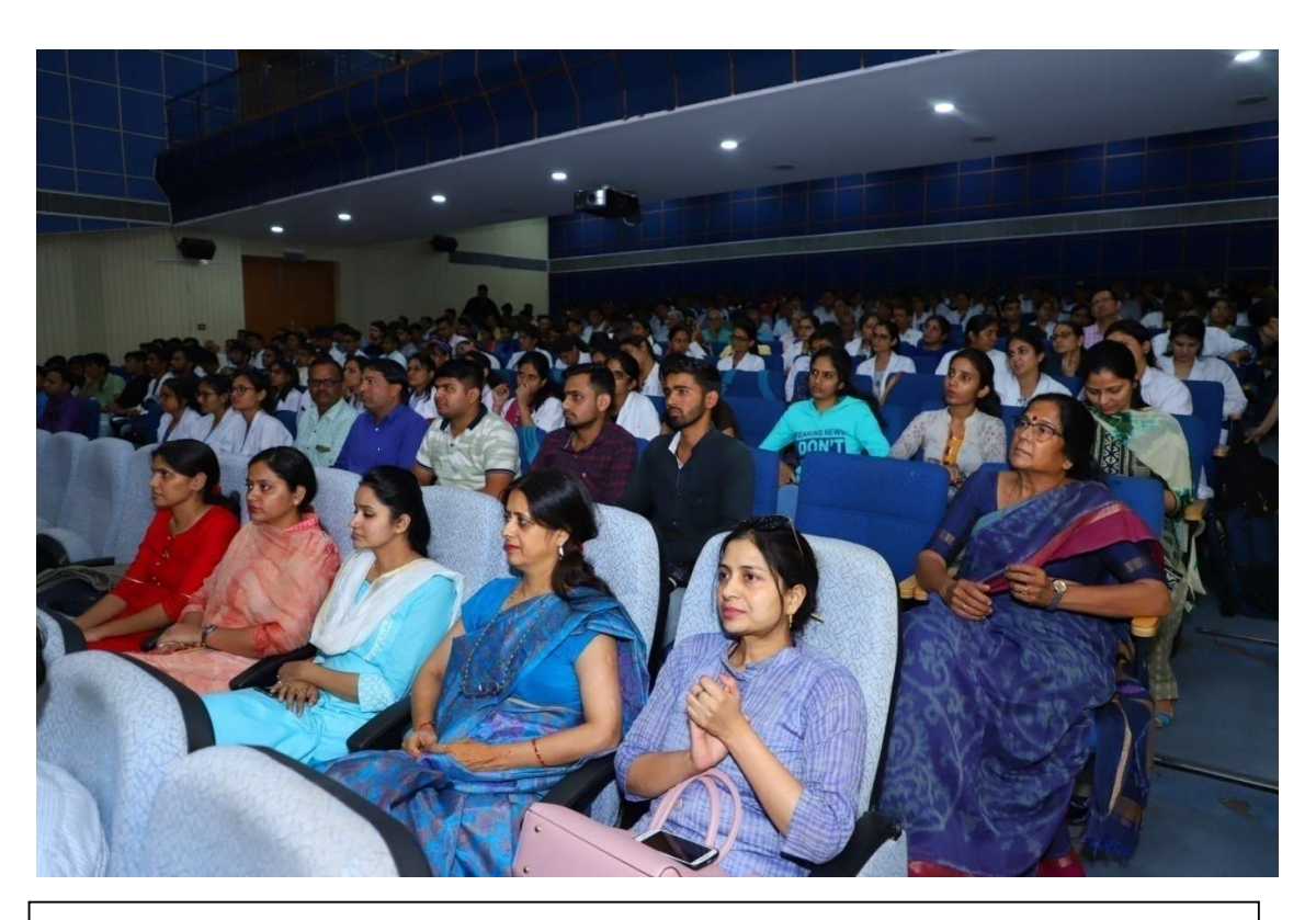
Faculty Member, Staff and Students enjoying during Hasya Kavi Sammelan – Hasya Se Swasthya organized by the Institute as part of celebration of Ayurveda Day-2019.