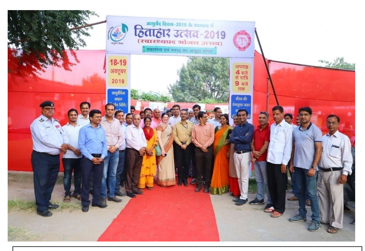
Hitohar Utsave – 2019 organised by Institute on the occasion of 4^{\text{th}} Ayurveda Day