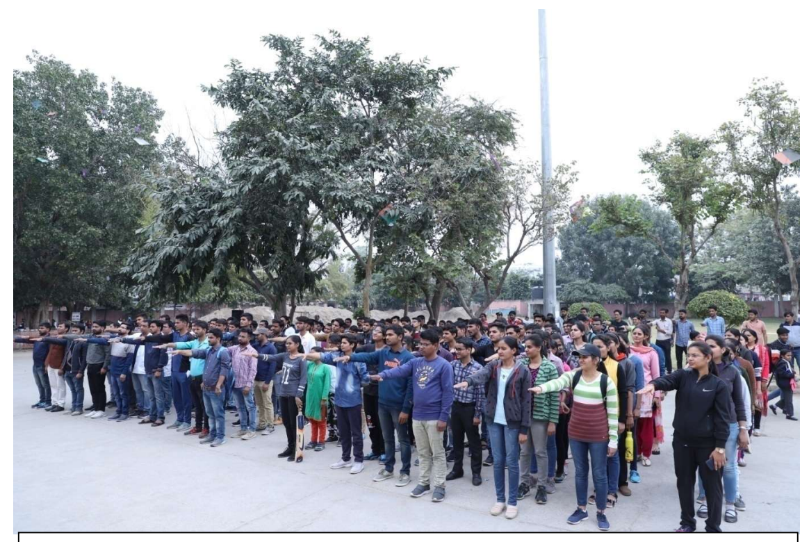
Students on oath taking ceremony of Annual Sports and Games – Tarang 2020.