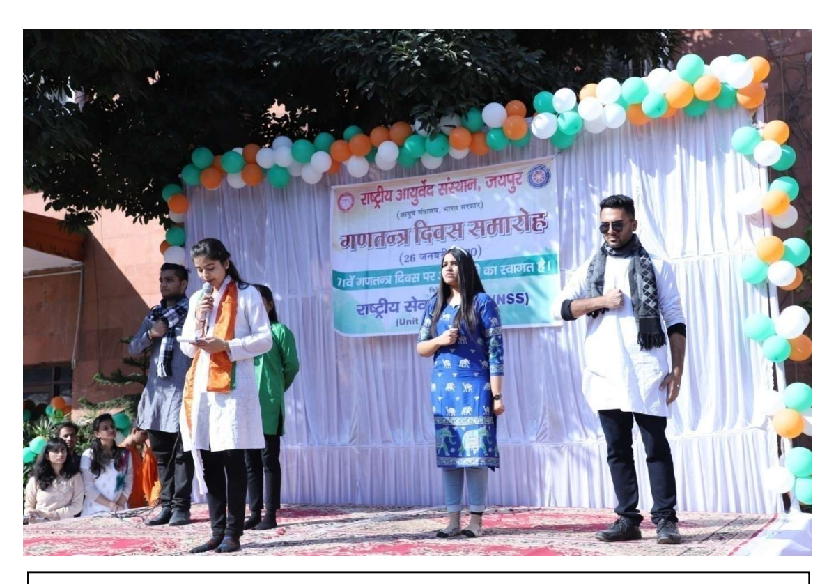
Students performing cultural program on the occasion of Republic Day Celebration