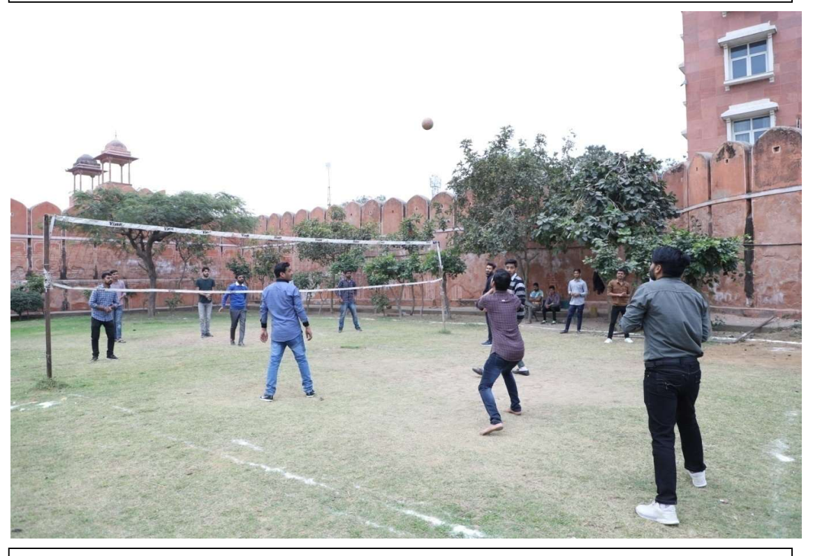
Students participating during different games during Annual Sports and Games – Tarang 2020.