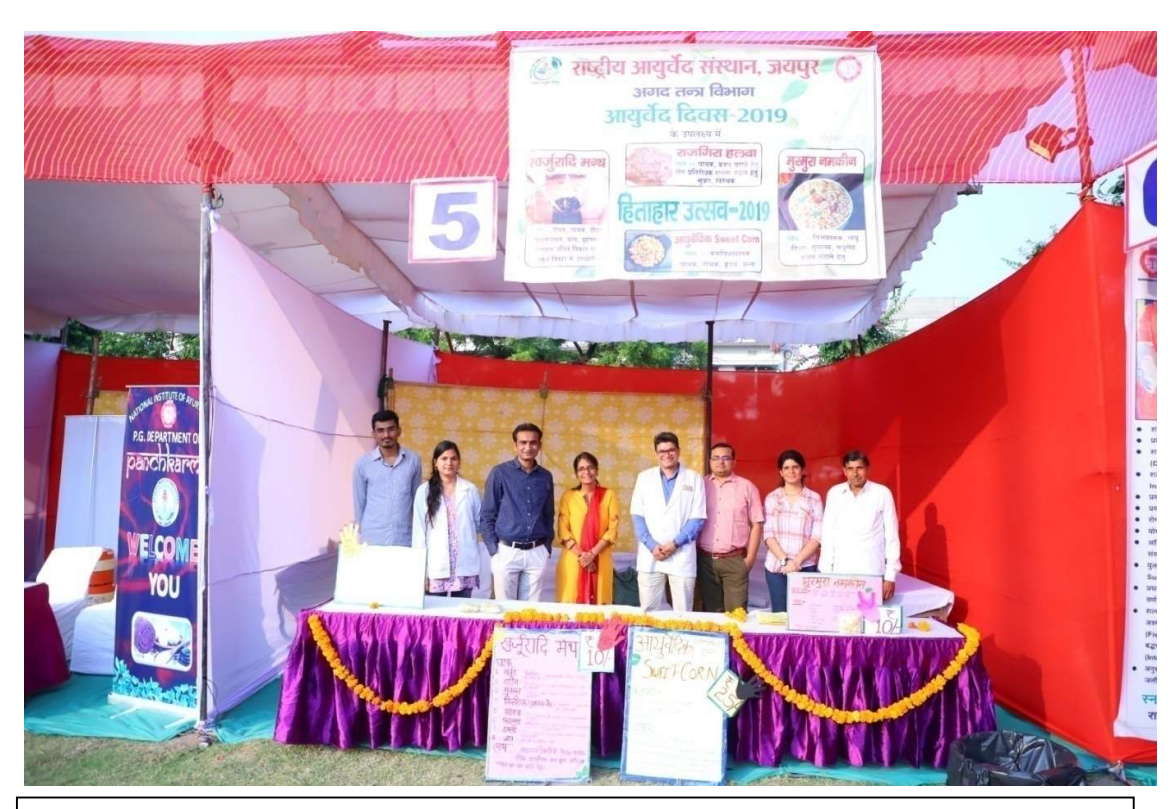
Food stall installed by Department of Agad Tantra in Hitohar Utsave – 2019 on the occasion of 4^{\rm th} Ayurveda Day