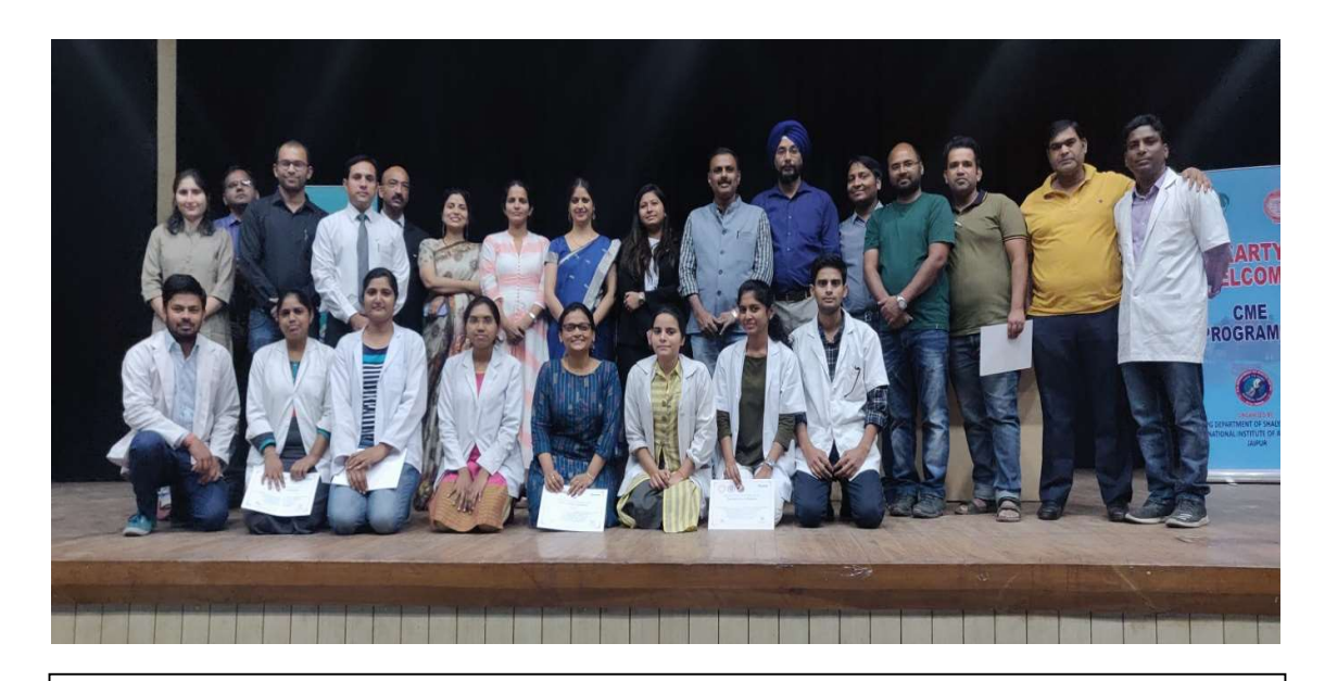
Faculty Members and Scholars of the Department participated in the free medical camp for piles patients in the Hospital