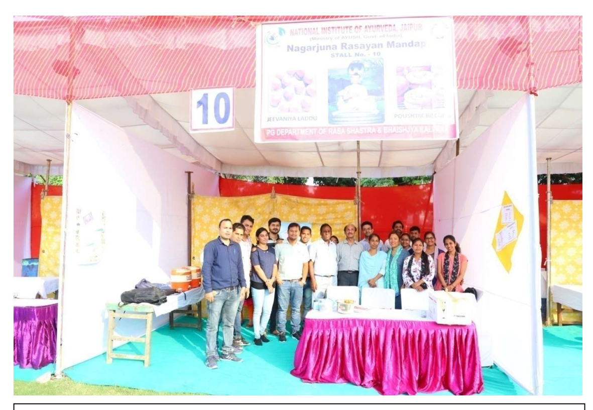
Food stall installed by the Department of Rasa Shastra in Hitohar Utsave -2019 on the occasion of 4^{th} Ayurveda Day