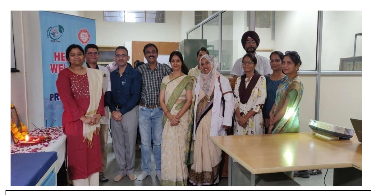
Faculty Members during CME Program conducted on subject of Osteopathy