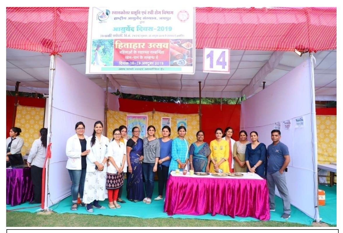
Food stall installed by the Department of Prasuti Eveam Stri Roga Vigyan \, in Hitohar Utsave – 2019 on the occasion of 4^{th} Ayurveda Day