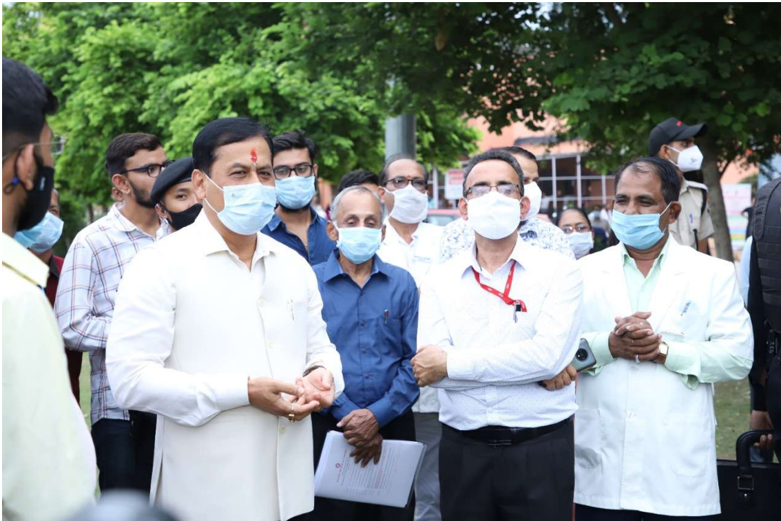
Glimpses from the Visit of Shri Sarbananda Ji Sonowal, Hon'ble Union Minister for AYUSH to NIA on 2-9-2021 for launching Distribution of AYUSH Prophylactic Medicines (Sanshamni Vati (Guduchi/giloy ghanvati) and Guidelines on Diet & Lifestyle in General Public for covid-19 to Geriatric Population of above 60 years and Front Line Workers, as part Celebrations connected with Azadi Ka Amrut Mahotsav.