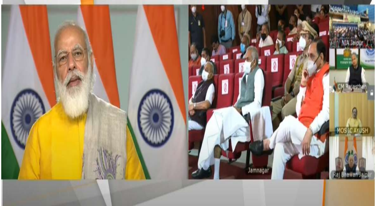
Hon'ble Prime Minister, Shri Narendra Modi addressing at the dedication ceremony of the National Institute of Ayurveda as Deemed-to-be-University on 5 th Ayurveda Day on 13-11-2020 by video conferencing.