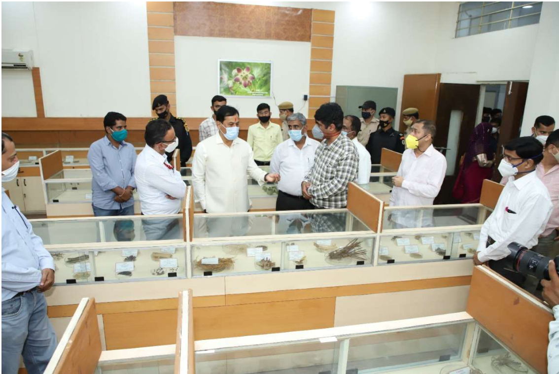
Glimpses from the Visit of Shri Sarbananda Ji Sonowal, Hon'ble Union Minister for AYUSH to NIA on 2-9-2021 for launching Distribution of AYUSH Prophylactic Medicines (Sanshamni Vati (Guduchi/giloy ghanvati) and Guidelines on Diet & Lifestyle in General Public for covid-19 to Geriatric Population of above 60 years and Front Line Workers, as part Celebrations connected with Azadi Ka Amrut Mahotsav.