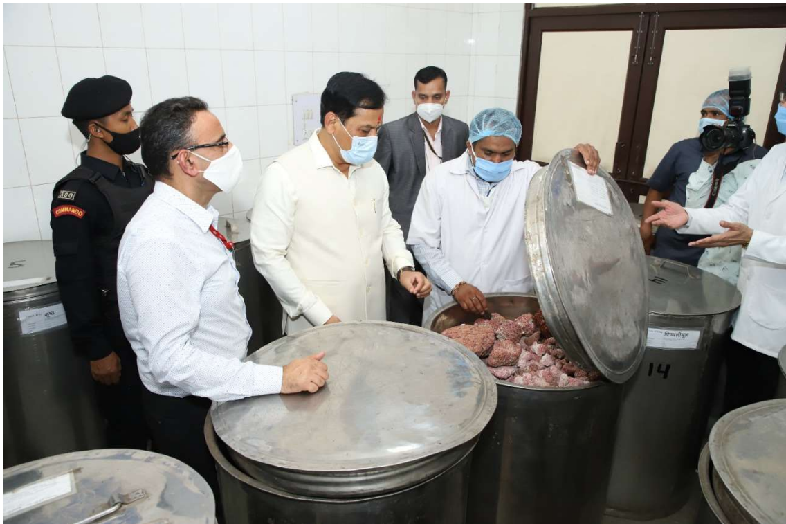
Glimpses from the Visit of Shri Sarbananda Ji Sonowal, Hon'ble Union Minister for AYUSH to NIA on 2-9-2021 for launching Distribution of AYUSH Prophylactic Medicines (Sanshamni Vati (Guduchi/giloy ghanvati) and Guidelines on Diet & Lifestyle in General Public for covid-19 to Geriatric Population of above 60 years and Front Line Workers, as part Celebrations connected with Azadi Ka Amrut Mahotsav.