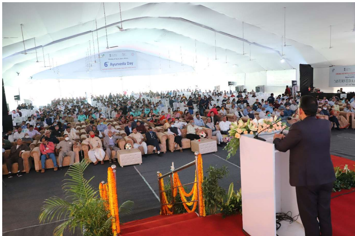
Glimpses from the Celebrations of 6th Ayurveda Day on 1 st and 2 nd November 2021