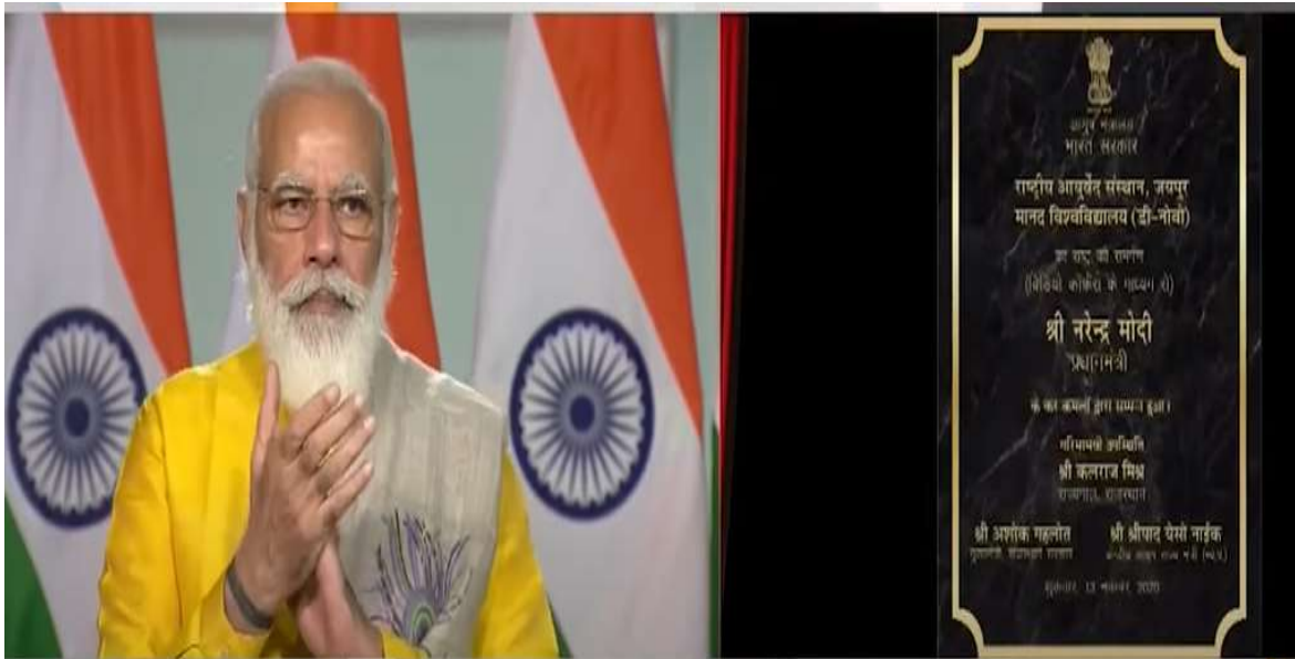
Hon'ble Prime Minister Shri Narendra Modi dedicating National Institute of Ayurveda as Deemed-to-be-University to the nation on 5 th Ayurveda Day on 13-11-2020 by video