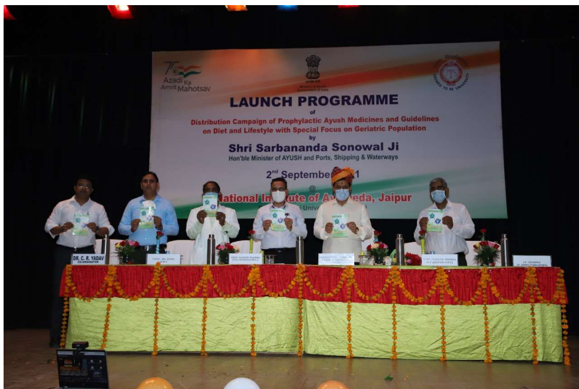
Glimpses from the Visit of Shri Sarbananda Ji Sonowal, Hon'ble Union Minister for AYUSH to NIA on 2-9-2021 for launching Distribution of AYUSH Prophylactic Medicines (Sanshamni Vati (Guduchi/giloy ghanvati) and Guidelines on Diet & Lifestyle in General Public for covid-19 to Geriatric Population of above 60 years and Front Line Workers, as part Celebrations connected with Azadi Ka Amrut Mahotsav.